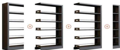
Main frame + Sub frame + Sub frame + Side panel